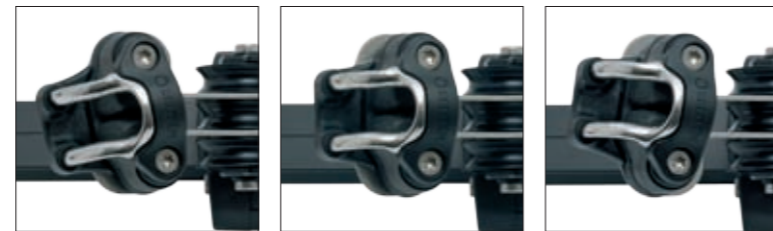
The cam cleat angle can be fine tuned vertically and horizontally, leading the control line straight to the trimmer.