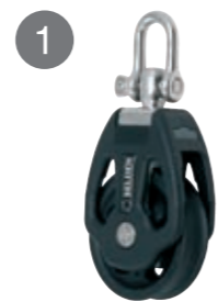
1 PBB 80 Single