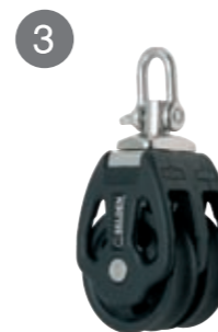
3 PBB 80 Double