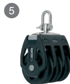
5 PBB 80 Triple