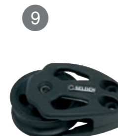
9 PBB 80 Single cheek