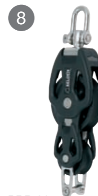
8 PBB 80 Fiddle becket