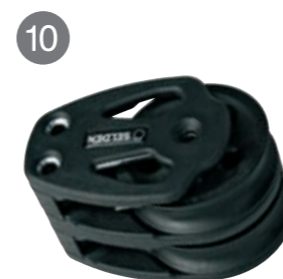
10 PBB 80 Double cheek