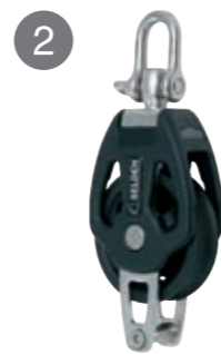
2 PBB 80 Single becket