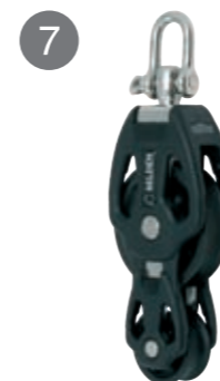
7 PBB 80 Fiddle