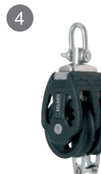
4 PBB 80 Double becket