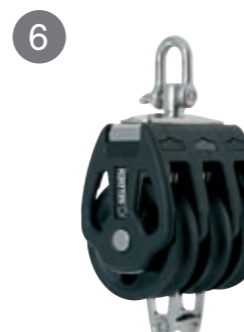
6 PBB 80 Triple becket