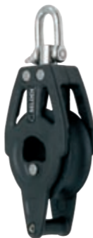
BBB 40 Single swivel/fixed, becket