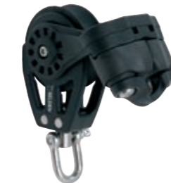
BBB 40 Single swivel/fixed, cam