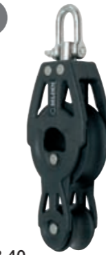
BBB 40 Fiddle swivel/fixed