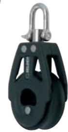
BBB 40 Single swivel/fixed