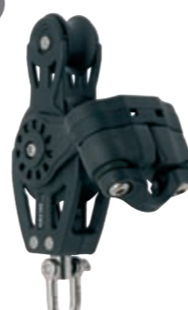
BBB 40 Fiddle swivel/fixed, cam