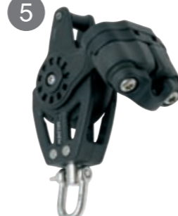
BBB 40 Single swivel/fixed, becket cam