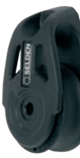
BBB 40 Single cheek