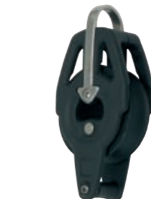
BBB 40 Single becket strap