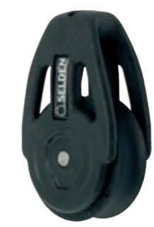
BBB 40 Single tie on