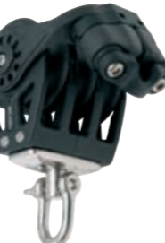
BBB 40 Triple swivel cam