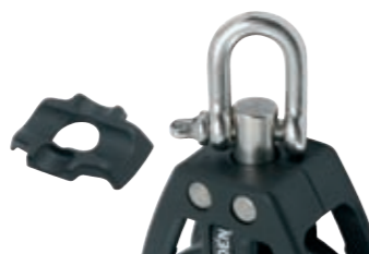
BBB 40 Double loop head becket