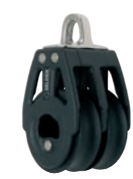
BBB 40 Double loop head