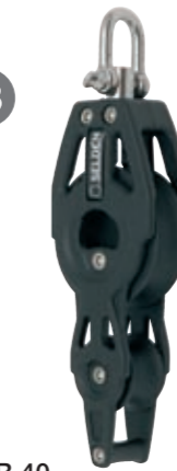
BBB 40 Fiddle swivel/fixed, becket