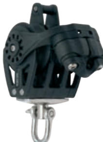
BBB 40 Triple swivel becket cam