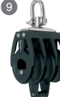
BBB 40 Triple swivel becket