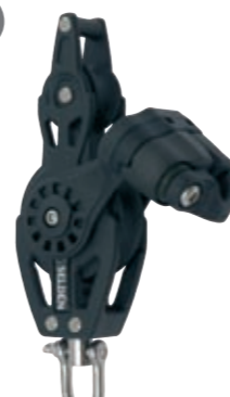
BBB 40 Fiddle swivel/fixed, becket cam