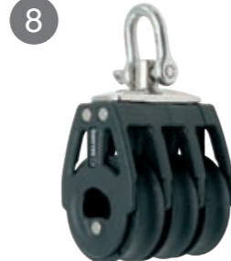
BBB 40 Triple swivel