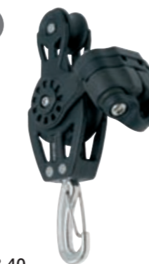
BBB 40 Fiddle hook cam