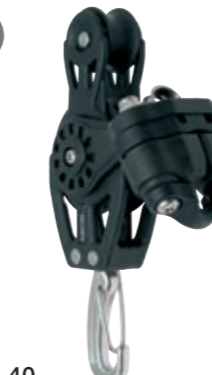
BBB 40 Fiddle hook cam eye